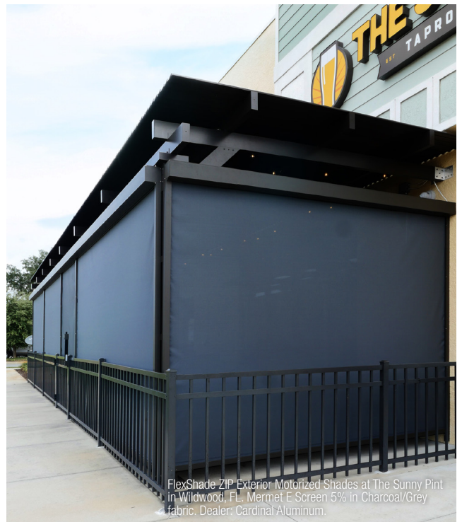
FlexShade ZIP Exterior Motorized Shades at The Sunny Pint in Wildwood, FL. Mermet E Screen 5% In Charcoal/Grey fabric. Dealer: Cardinal Aluminum.