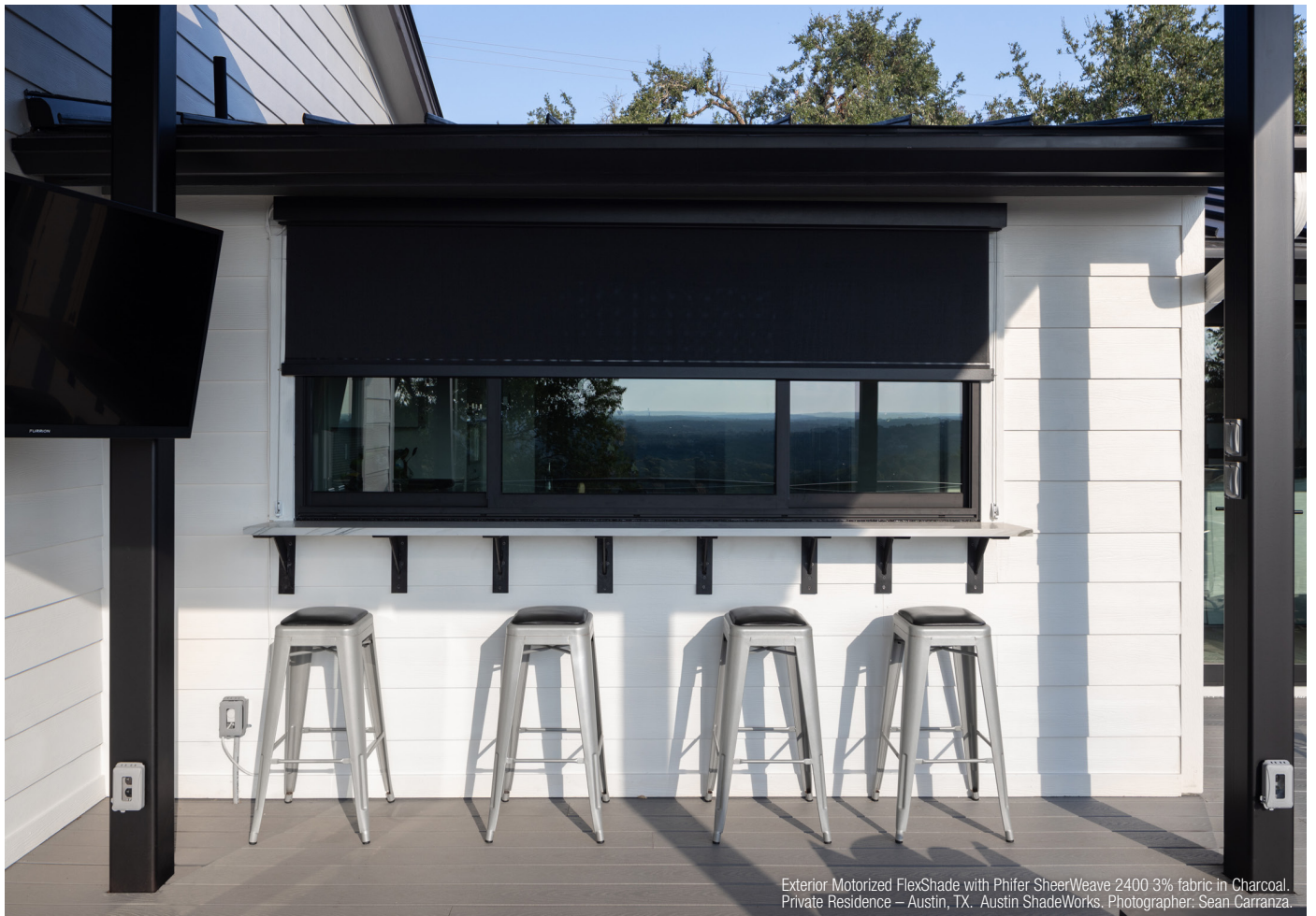
Exterior Motorized FlexShade with Phifer SheerWeave 2400 3% fabric in Charcoal. Private Residence – Austin, TX. Austin ShadeWorks.