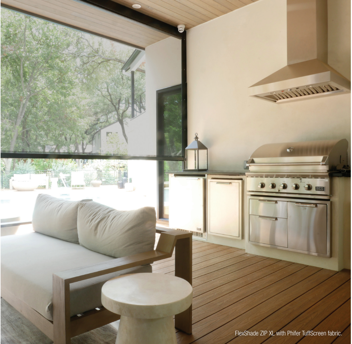
FlexShade ZIP XL with Phifer TuffScreen fabric.