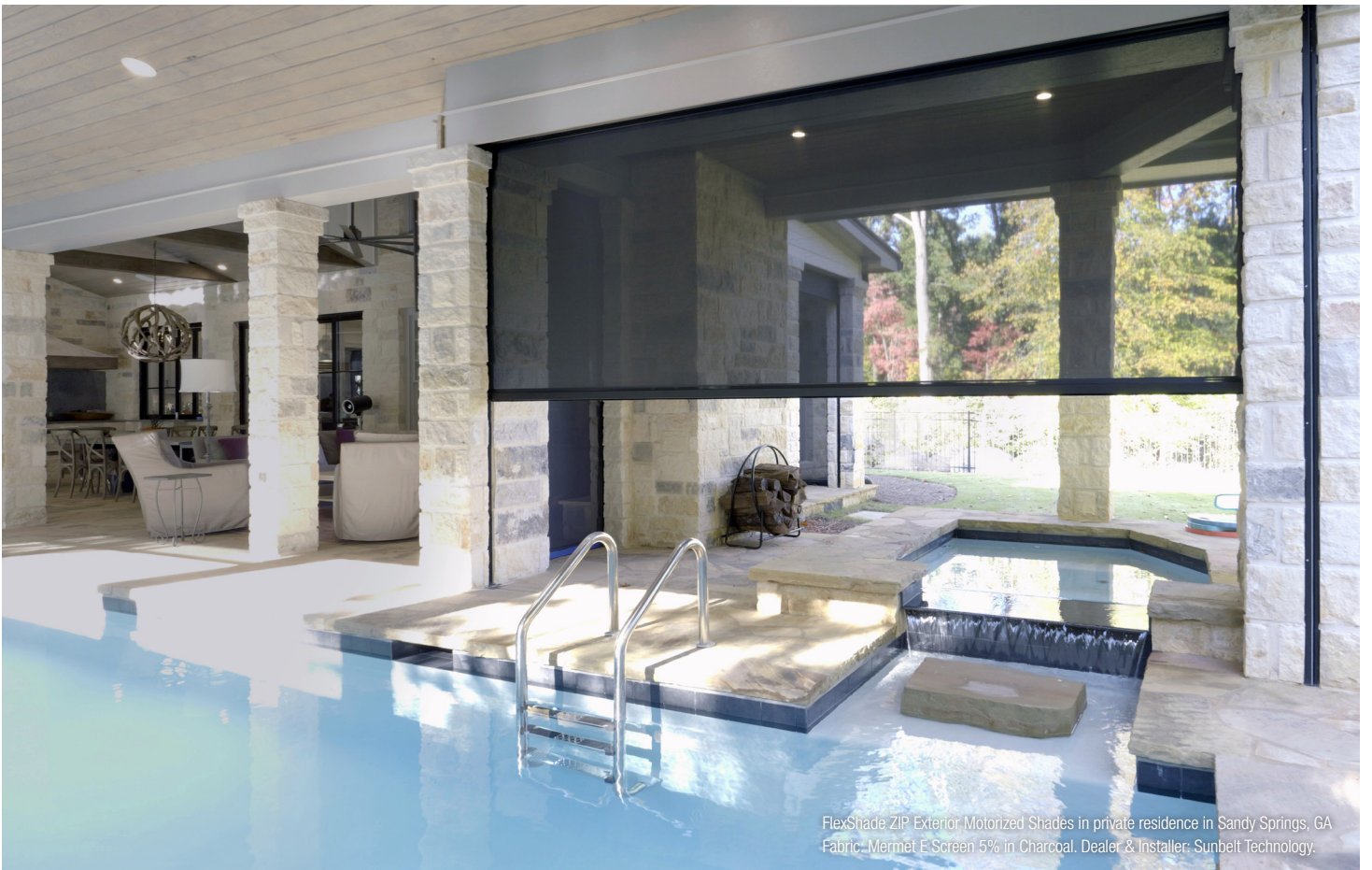
FlexShade ZIP Exterior Motorized Shades in private residence in Sandy Springs, GA Fabric: Mermet E Screen 5% in Charcoal. Dealer & Installer: Sunbelt Technology.