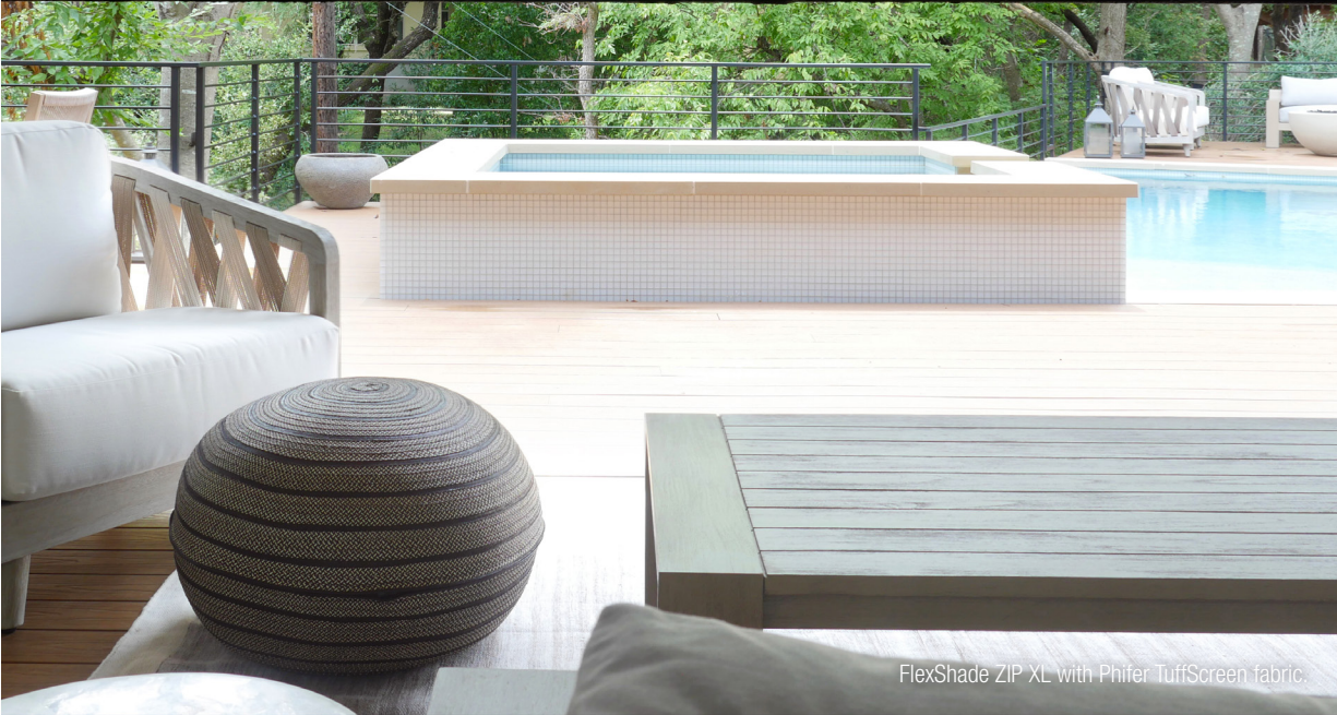
FlexShade ZIP XL with Phifer TuffScreen fabric.